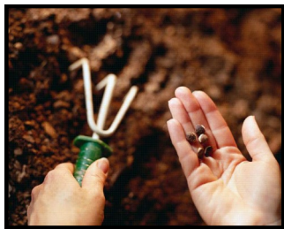
Caring volunteers teach new gardening skills and self-confidence