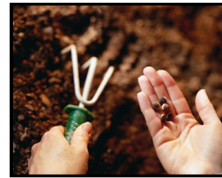
Caring volunteers teach new gardening skills and self-confidence