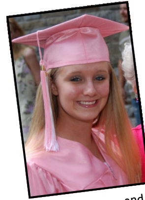
Healing, success, and a new beginning

During Lent and Easter Christians Celebrate Jesus' Resurrection And Our New Life Through Him!