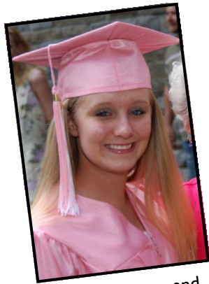
Healing, success, and a new beginning

During Lent and Easter Christians Celebrate Jesus' Resurrection And Our New Life Through Him!