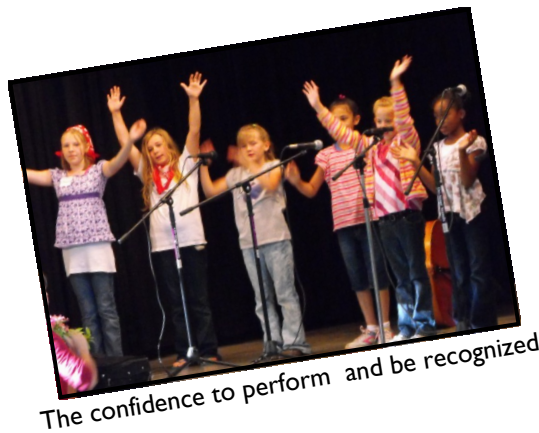
The confidence to perform and be recognized

Your gifts to Grandfather Home for Children offer a new life to the children in our care! Thank you!