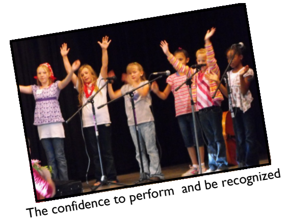
The confidence to perform and be recognized

Your gifts to Grandfather Home for Children offer a new life to the children in our care! Thank you!