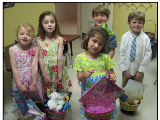
A Sunday School class at First Presbyterian Church, Boone, made Easter baskets for the children at Grandfather Home.